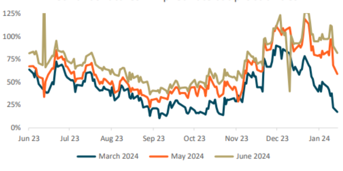
Fed funds futures - implied rate cut probabilities